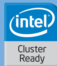
Figure 1. Intel teamed up with leading hardware and software vendors to make it easier to buy, deploy, and maintain HPC clusters—and exploit the high performance of Intel® processor-based high-performance computing.